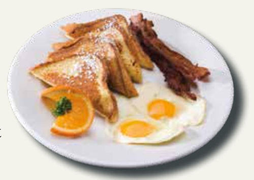
French Toast Combo

Two golden slices of French toast topped with cinnamon sugar. Served with two eggs & your choice of two bacon strips or two sausage links.