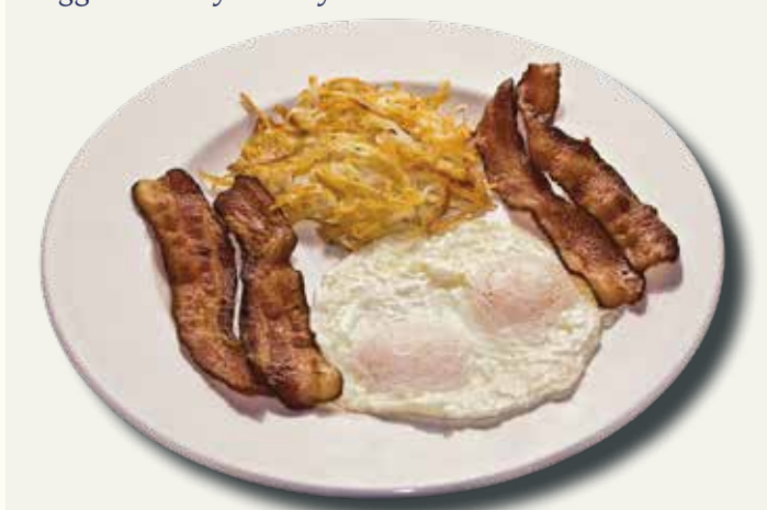
The Classic Combo

Your choice of bacon, ham or sausage links with two eggs cooked your way and hash browns.